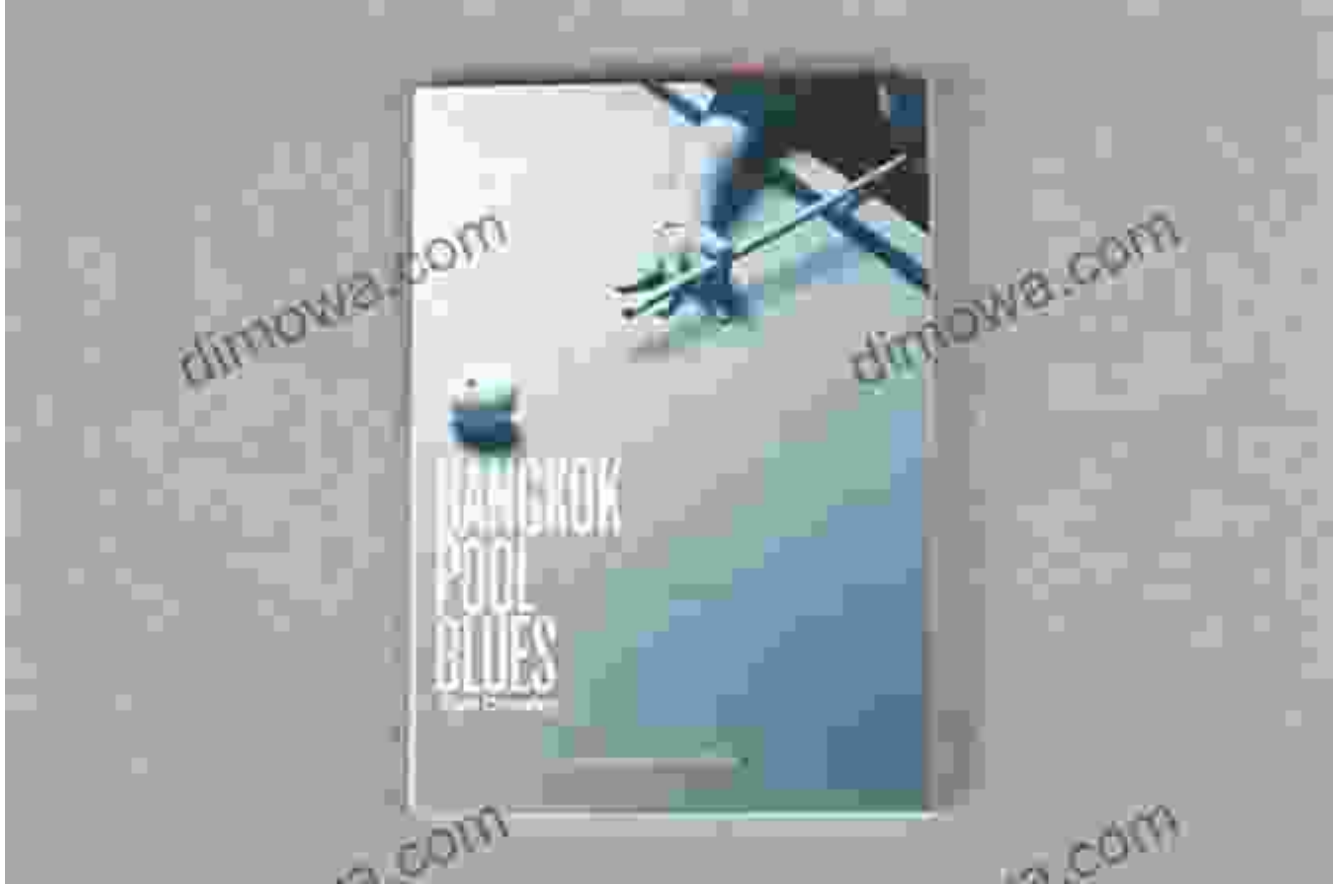
Unravel the Intricate Tapestry of Characters

"Bangkok Pool Blues" introduces a cast of unforgettable characters who inhabit this enigmatic city. From the enigmatic and alluring Kat, a nightclub owner with a past shrouded in mystery, to the enigmatic businessman Victor, whose motives remain elusive, each character adds a layer of complexity to the narrative.